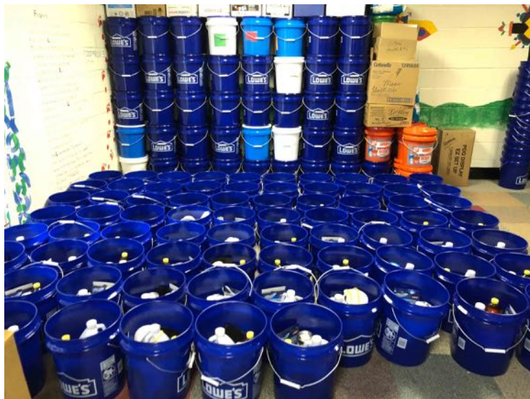
NALC Disaster Response has flood buckets ready for families as they return to their homes following Hurricane Florence.

Florence is being called a record-breaker, with widespread destruction anticipated. Much like Hurricane Harvey that struck the Houston area last year, Florence lingered in the area for days, bringing record rainfall and producing historic floods