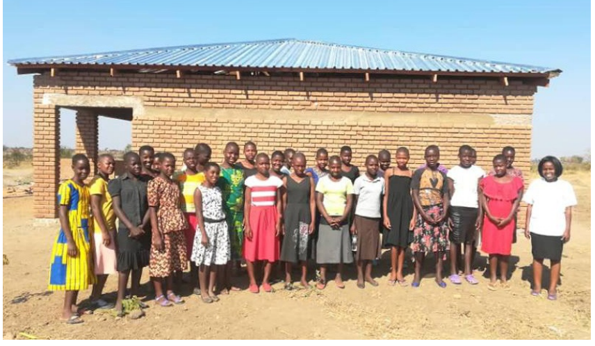
Students pose in front of new classroom at Kuwala Christian Girls School in Malawi established by members of Joy Lutheran Church in Winnipeg.

September 2018 saw staff and 60 students begin high school. Sixty girls with a brighter future.