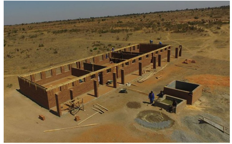
Construction in progress at Kuwala Christian Girls School in Malawi.

+ Give your donations of money, talents, abilities and presence. $100 a month covers the cost of educating one girl. Men's groups, women, seniors,