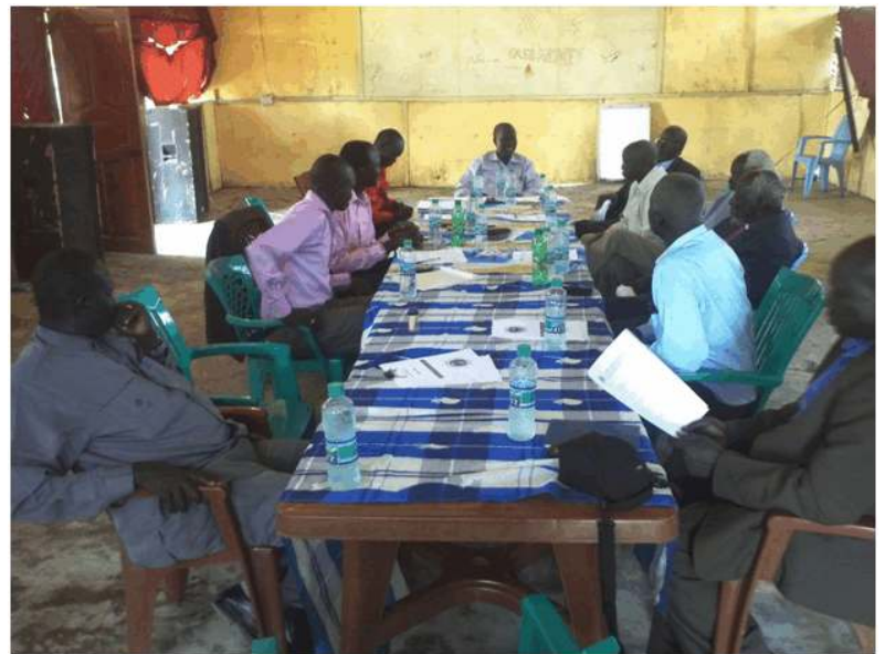
A meeting of the St. Luke's Theological College Board of Governors in Bor, South Sudan.

It will take some time before St. Luke's becomes fully self-sustaining. During this initial phase, congregations of the NALC can be a part of this exciting new mission by helping to cover some of