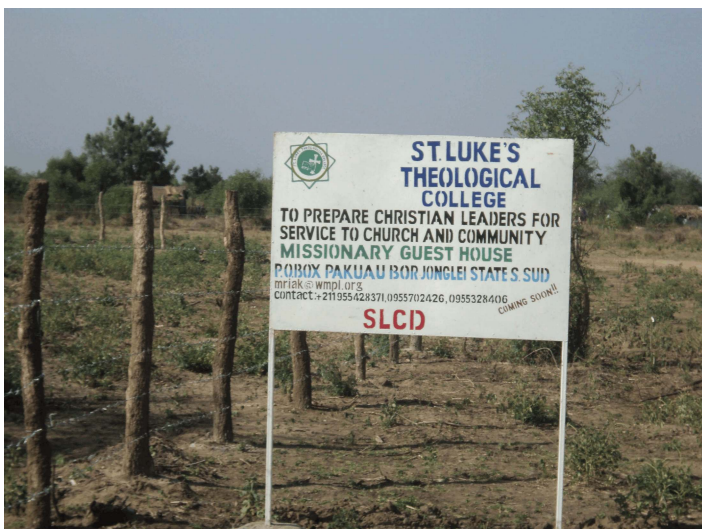
Sign at future site of St. Luke's Theological College.

The vision for St. Luke's Theological College is a college which will offer intensive classes three times a year in the areas of theology, leadership