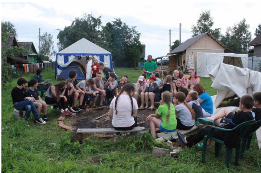
Summer Bible camp at Dolsha

The Lord has been good to us and below is a report of the good spiritual harvest.