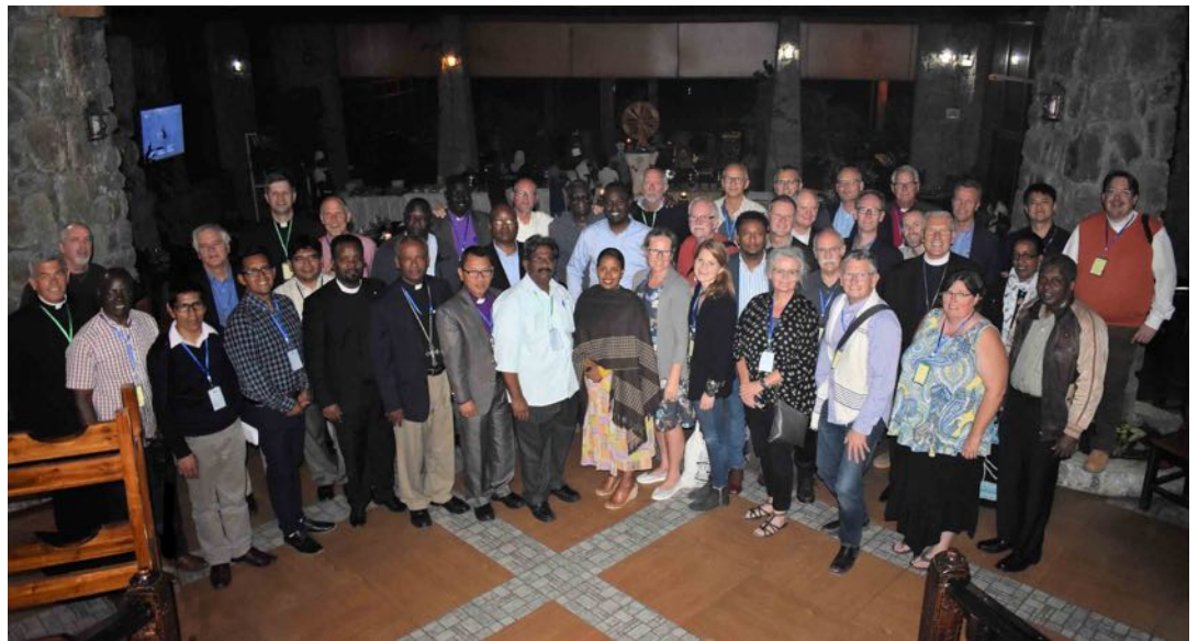
Participants at the Global Confessional and Missional Lutheran Forum in Bishoftu, Ethiopia.

With these scriptural words quoted in the Initial Statement on the Ecumenical and Inter-Lutheran Commitment of the North American Lutheran Church , approved at the 2011 NALC Convocation, we acknowledged the goal for which our Lord prayed at the Last Supper, as He said, “Holy Father keep them in thy name, which thou hast given me, that they may be one, even as we are one. ... The glory which thou hast given me I have given to them, that they may be one even as we are one, I in them and thou in me, that they may become perfectly one, so that the world may know that thou hast sent me” ( John 17:11, 22-23 RSV ).