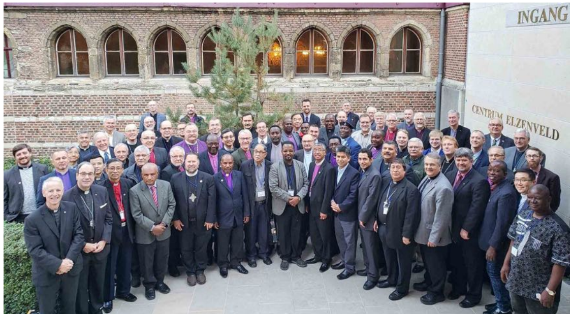
Participants at the International Lutheran Council Conference in Antwerp, Belgium.

You will be seeing news and information about three such NALC efforts that have as their aim the developing of relationships in accordance with our commitment to the Scriptures and the Lutheran Confessions, but always to further mission in general and specifically our obedience to the Lord’s