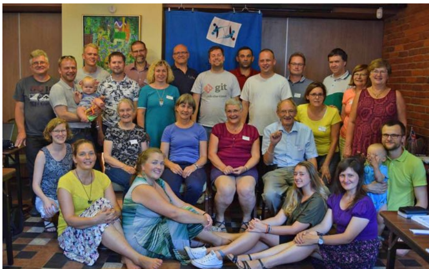
European Lutheran Sunday School Association

We are very grateful to those who voted for our song, "100 Stones." It was selected to play on the radio. The song is based on the well-known book, The Pilgrim's Progress by John Bunyan. It is about stones, representing our sins and Jesus as the one