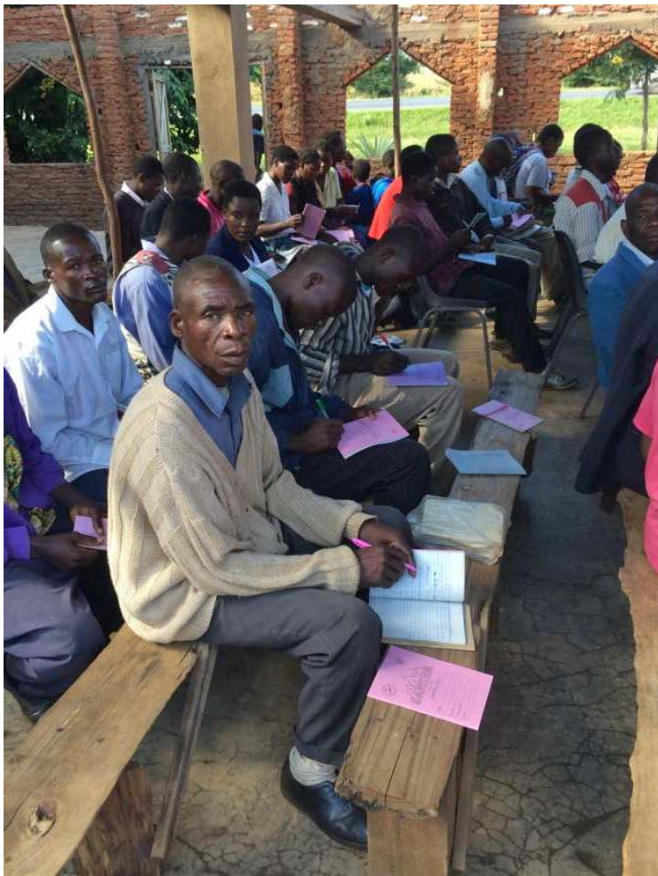
About 130 village pastors in Malawi listened to teaching from two NALC pastors.