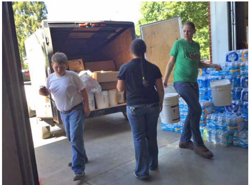
Volunteers unloading NALC Disaster Response supplies at St. Timothy Lutheran Church in Charleston, W.Va.

St. Timothy Lutheran Church, a NALC congregation in Charleston, W.Va., is prepared to host volunteer teams with a fellowship hall and showers for volunteers.