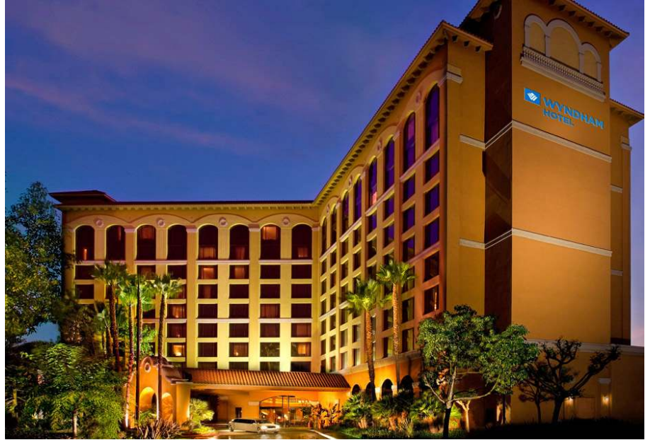
The 2016 NALC Convocation will meet at the Wyndham Hotel Anaheim Garden Grove in Anaheim, Calif.